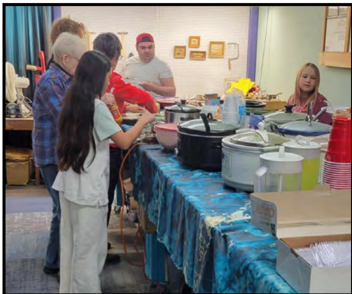
A few people checking out the food.