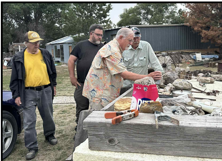
Checking out some of the wares at Crawford