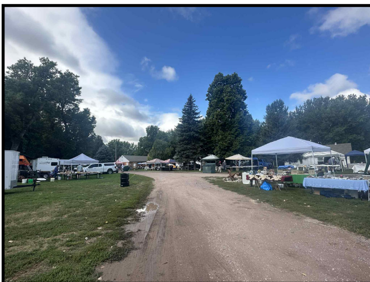
A portion of the Crawford Swap

I look forward to seeing you all at our meeting.