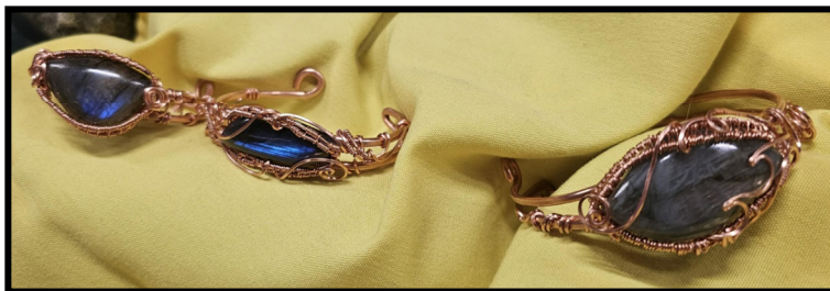
Three of the finished bracelets

At this time, the next class date and time have not been revealed to me, nor what the project will entail. Keep your eyes on the club Facebook page for upcoming information.