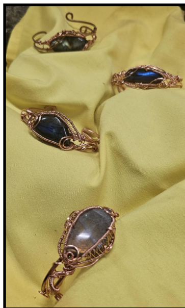
More finished bracelets