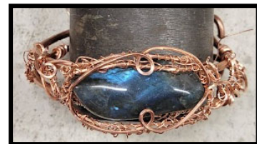
Project by one of the new students