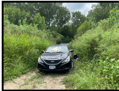
Farm track to river

After leaving Pawnee City, the group of eight vehicles pulled off farm road 637 Ave. about 10:30 a.m. just before the bridge across the Big Nemaha, onto a track leading about a quarter of a mile to a sand bar on the river, where the group parked and got out of their vehicles to explore. The sand bar, a fantastic spot for rock hunting, would turn out to be treacherous for smaller vehicles and anything without 4WD, although this would not become obvious until the afternoon.