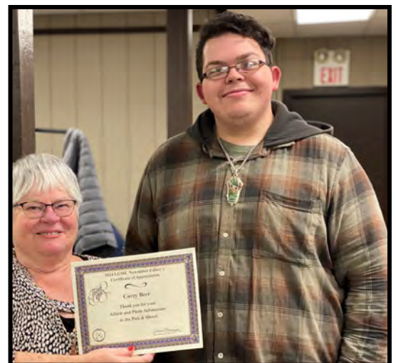
The tall and the short of it.