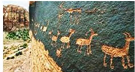
Petroglyphs near Moab, Utah.

Now the clouds grow dark and are messengers of rain, They bring a breeze scented with sage over the terrain. An eagle soars as a guardian above the canyon below Over messages in stone only the ancients truly know.