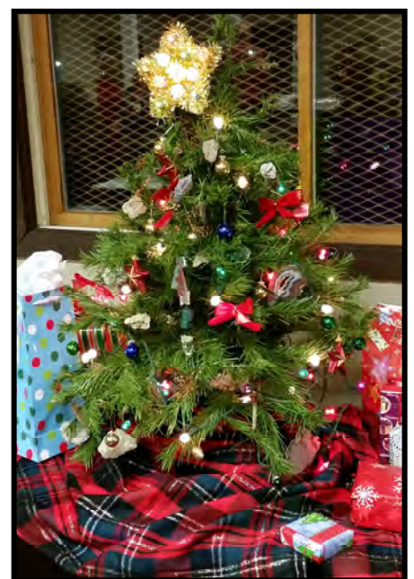
Contributors to the Pick & Shovel