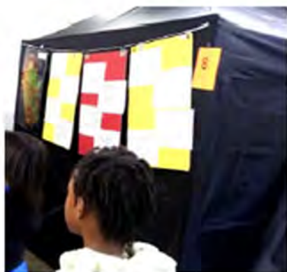
Black tent for fluorescent room.