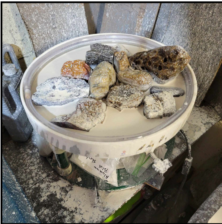
Picture shows placement of second ring. Splash shown occurred prior to the second ring being implemented.

By adding a second ring, the water seems to be caught by the top ring and flows back into the pan. Not a complete cure but it does cut down on splash.