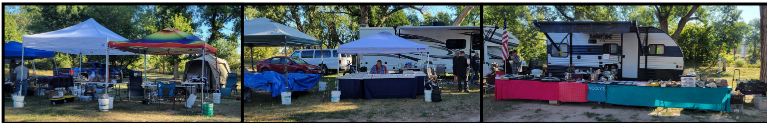
The LGMC Vendors at the Crawford Rock Swap over Labor Day weekend.