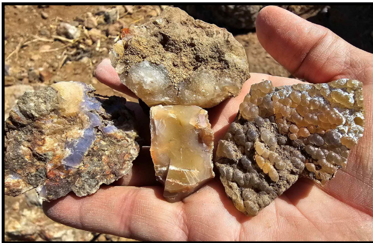
Corey found some cool rocks on his summer adventure.