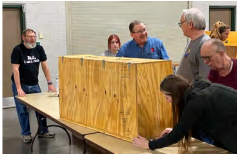
There were lots of helpers putting up (and tearing down) the display cases.