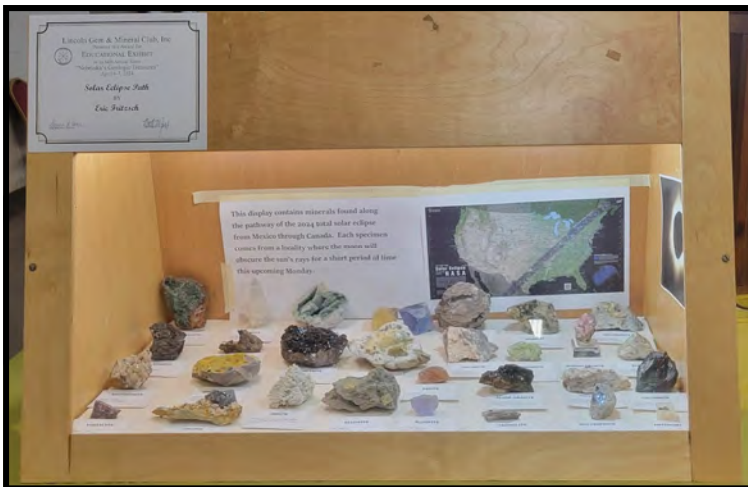
Eric Fritzsch's case of Solar Eclipse Path Minerals won First Place in Most Educational Display.