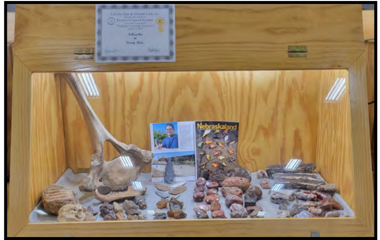
Corey Beer's case of Nebraska Specimens won Third Place in overall displays.