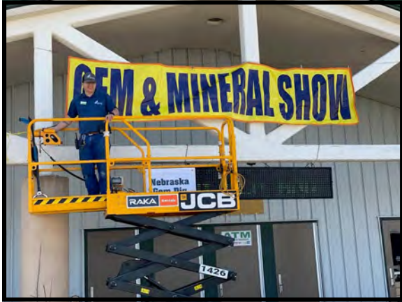
Event Center worker hanging our banner.