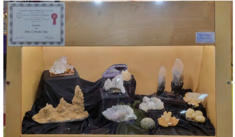
Mike and Donitte Stiles' case of Crystals won Second Place in overall displays.