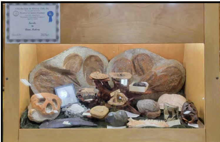
Anne Malone's case of Fossils won First Place in overall displays.

CONGRATULATIONS WINNERS!! THANKS TO EVERYONE WHO PROVIDED A DISPLAY AT THE SHOW.