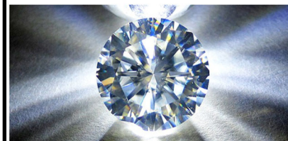
Moissanite (synthetic silicon carbide). Looks like diamond, but it is softer.

On the other hand, “fake” or “imitation” crystals are crystals that are presented to be a different crystal than they are, or are not crystals at all. Garnets may be presented as rubies, glass as any number of different crystals, or doublets or triplets of stones presented as entirely that stone. Doublets and triplets are most commonly used for opal, and consist of a thin plate of opal attached to a backing stone (or other material). Doublets stop here, while triplets add a domed crystal, commonly quartz, to imitate the look of an opal cabochon. Many imitation crystals can look very realistic, and vendors may not disclose that they are imitations. Some crystals are also sold under misleading names to make the buyer think they are more valuable than they may be. For example, clear quartz may be sold as an “Alaska Diamond” with higher prices.