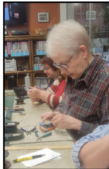
Students focused on the intricate wire weaving.