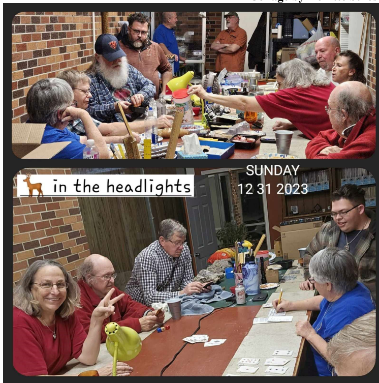
Collage by Donitte Stiles

We ended up the night playing a card game called "Deer in the Headlights" purchased at a yard sale, which I still declare is the best 25 cents I've ever spent on a game. The game was declared FUN by those playing!