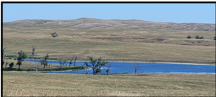
Agate Lake