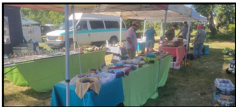
Hidden Gems by The Jewelry Connection