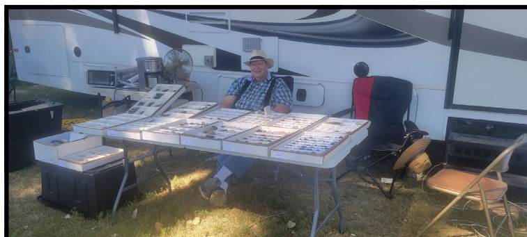
A few items for sale by JimsPastTime

The annual swap at Crawford is a lot of fun; buying, selling, and collecting. Consider attending next year.