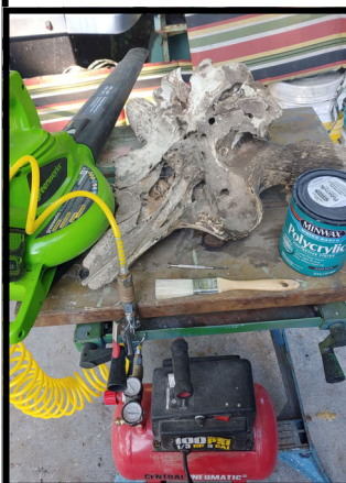
Project tools and supplies

When I find a skull, it is usually in or near a stream, wet and full of mud and/or gravel (they can be very heavy). The first thing I do when I get it home is spray it with a hose to get the mud and gravel out as best I can, being careful not to spray too hard and damage it. This skull was already dry, but was full of dried debris. I took the hose to it and cleaned it the best I could with water. The next step was to dry or redry the skull. You have to be careful not to dry too quickly or it may crack and fall apart. I generally put them in a corner in the basement where there is more humidity and leave it for at least a week to dry slowly. Once this skull was dry, there still was a lot of mud inside. I took a micro screwdriver and chipped away. A compressor was used to blow out the loosened debris. I also used a leaf blower for cleaning bigger areas. After I cleaned the skull, I used a polyester soft bristled paint brush to apply Polycrylic, a water based sealer from Min-Wax. It can be found at the local hardware store. I get the satin sheen as it leaves a durable, natural looking finish. Spraying a clear lacquer to the brain cavity is not visible but helps to reinforce it from the inside. I intend to bring the finished product to the next meeting.