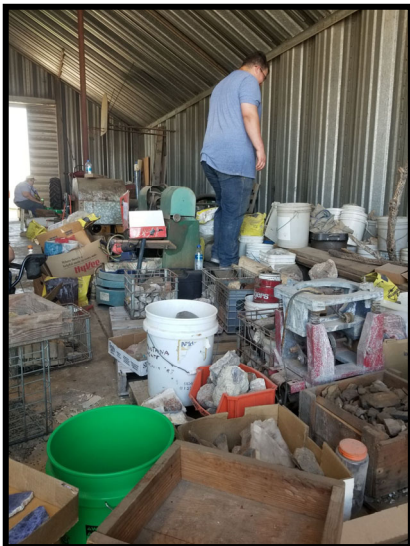
Digging out specimens in order to clean and sort