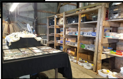
bythebeerslapidary - Corey Beer