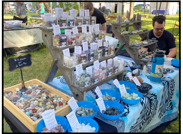
Oddballs & Outcasts - St. Clairs