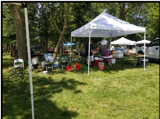
Sunday Food Vendor - Raina on the Run