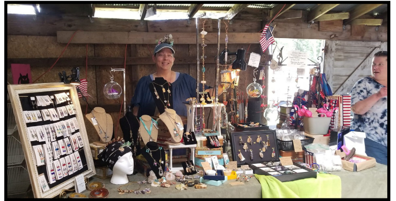
Black Kat Gallery