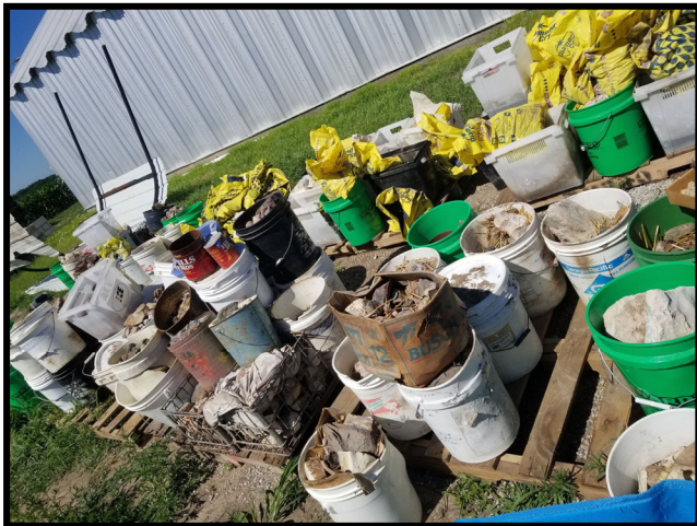
A few items before the cleaning and sorting started

http://www.fordfordauctioneers.com/index.php/features/item/936-upcoming-2-day-rock-auction-saturday-september-24th-sunday-september-25th-2022-geneva-ne