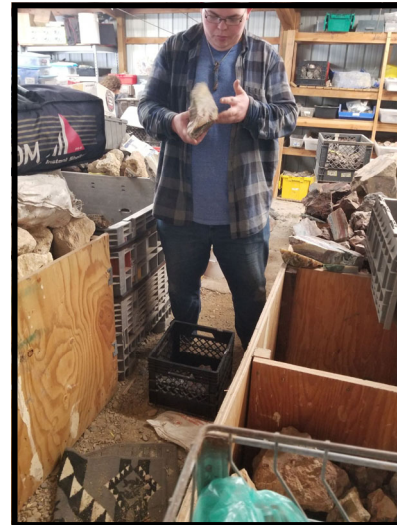
Travels to Idaho