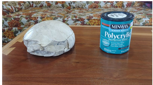
Fossil Turtle sealed with Minwax Polycrylic (top side)