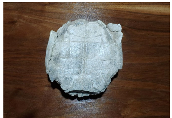
Fossil Turtle sealed with Minwax Polycrylic (bottom side)