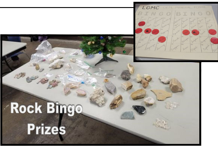
Rock Bingo Prizes