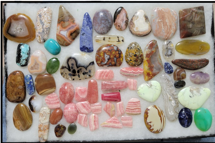
Mexican agates, Montana agates, poppy agate, verascite, citrine chrysoprase, jaspers, Mexican fire agate, turquoise, rhodochrosite, sodalite, petrified wood, some unknown specimens