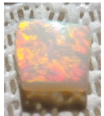
This is a closeup of the little white square (opal) in the picture to the left