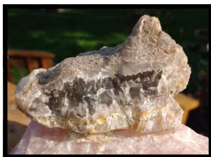
Nebraska Blue Agate