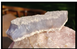
Lakota Blue Ice Chalcedony