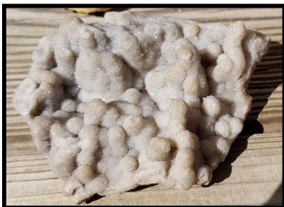
One of Corey's Missouri rocks. See story on page 5.