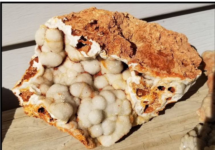
One of Corey's rocks