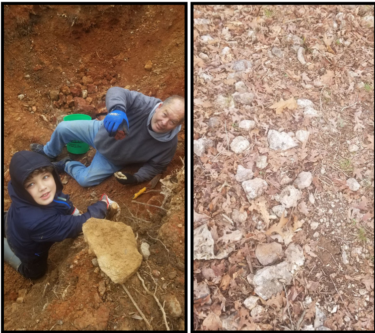
What the location looks like