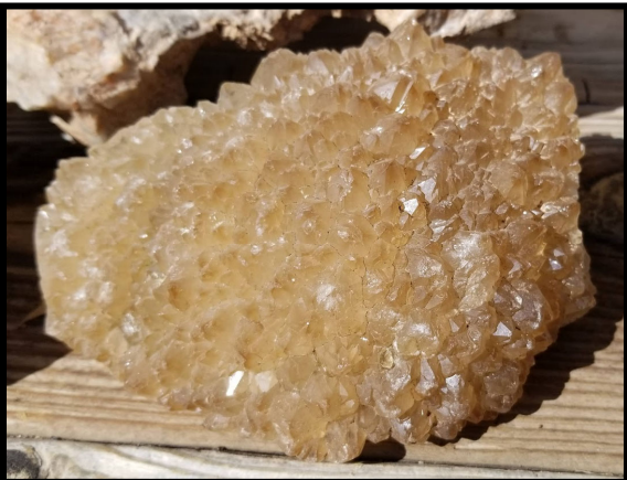
One of Corey's Missouri rocks. See story on page 5.

See schedule of events on page 10 for the 2021 National Show in Big Piney, Wyoming on June 16 - 22.