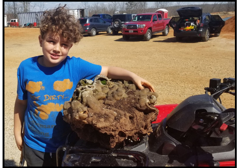
Ja-zeil and the 107 pound specimen