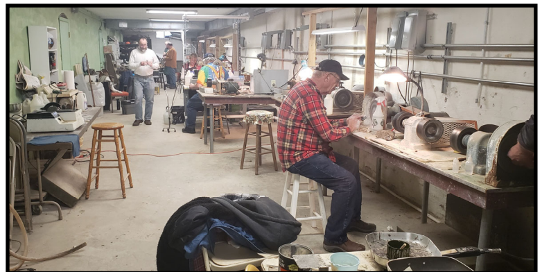
Lapidary Class at Auld Pavillion basement

At some point you may find that your silver looks dull and gray after tumbling for a length of time. This is the barrel breaking in – it doesn't usually happen right away but after a few tumbling sessions. If it should happen, remove your jewelry, rinse the shot well and return the shot to the barrel. Add enough FLAT Coke to cover the shot by about 1/2 an inch. Flat Coke is important so that it doesn't fizz out of control and pop your lid! Tumble with flat Coke for a couple of hours, rinse everything well, then put the shot back in the barrel with soap, tumble for a few hours. At this point, rinse one more time, add fresh soap, throw your sad looking jewelry back in with the shot and tumble for a few hours. It should come out shiny and pretty after all that. If not, repeat the procedure. It can take 2 or 3 runs with Coke to clean the barrel sufficiently.