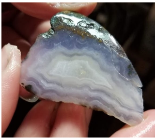
Evan's Aztec purple lace