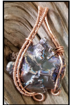
Nycky whipped out these two wire wraps for Evan in no time flat. Amazing!