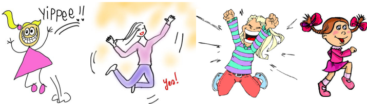
Outgoing editor's note