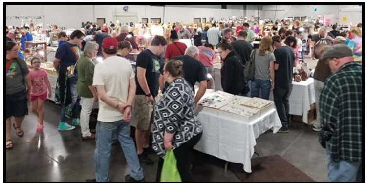
It looks like a good crowd!!