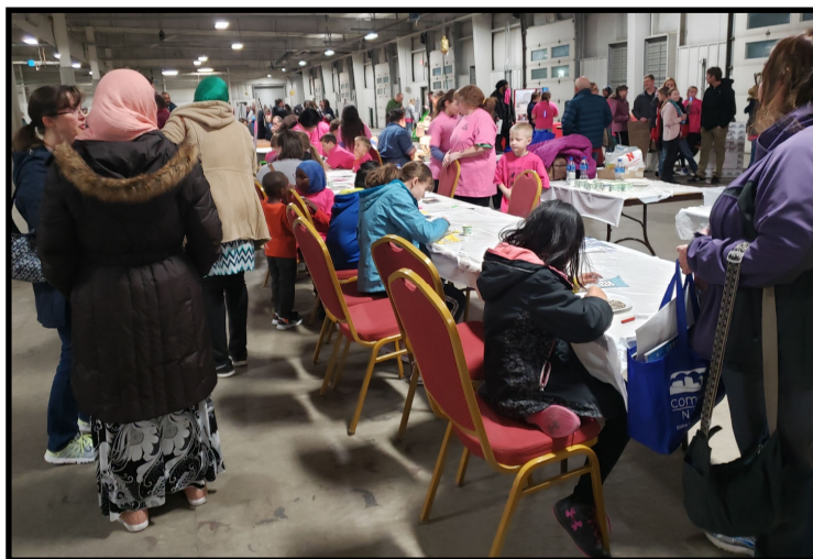
The LGMC booth at the Science Fair. Looks like a good crowd!