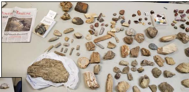
Some Wyoming finds