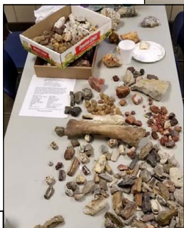
Some Beer finds

I hope our paths cross this month. Cheers!