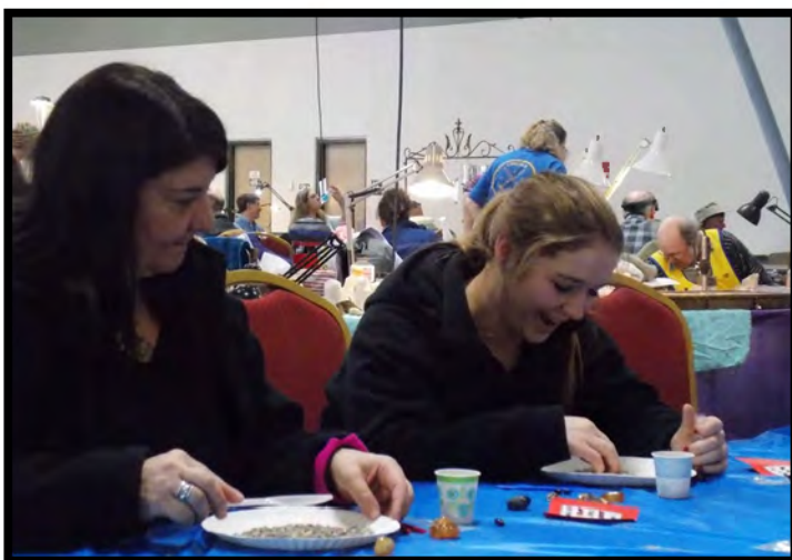
Kids of all ages love the Gem Dig!