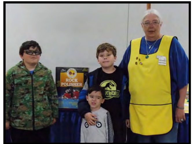
These lucky young fellows were the winners of the raffle. They are all set to polish stones now!