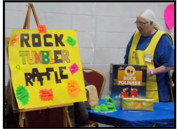
The Youth Group raffled off a Rock Polisher at the Show