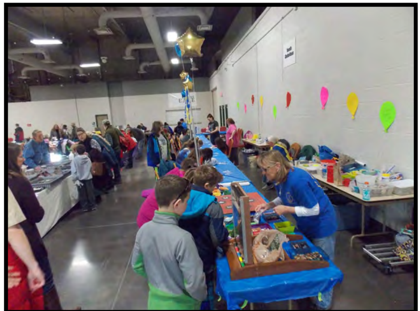
The Youth Group ("Mineral Monkeys") had another busy time with their booth, providing a gem dig, rock race, and other games and activities. Our Gem Dig is a hit everywhere we take it!!