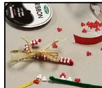
The fun activity was making Christmas ornaments with beads and pipe cleaners.