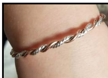
Elayna's finished bracelet. Twisted sterling silver wire entwined with copper. Great job, Elayna!