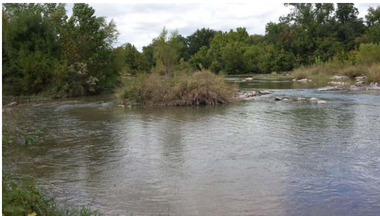
Where Jayne and Corey hunted for rocks in Texas.