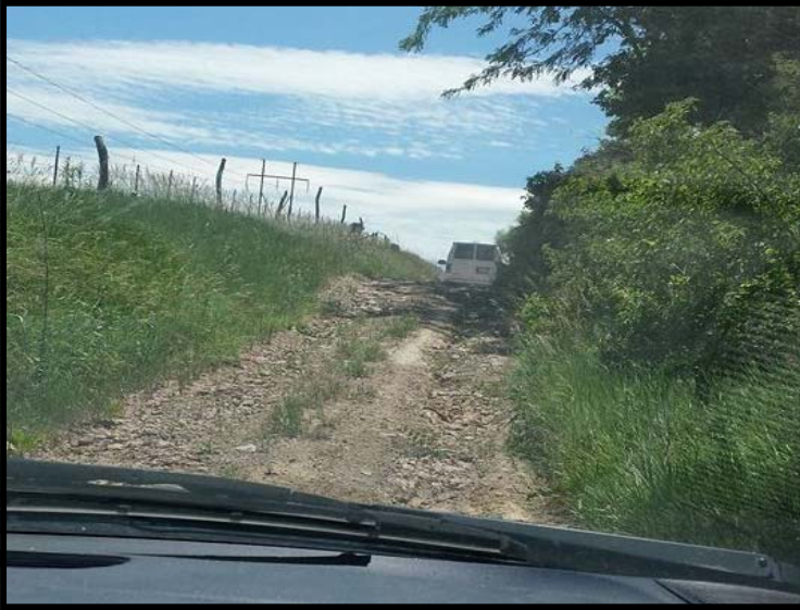
The "good" section of the Yippeekaii Yay road!

GET INVOLVED! You won't be sorry! This is a great group of people! Cheers!