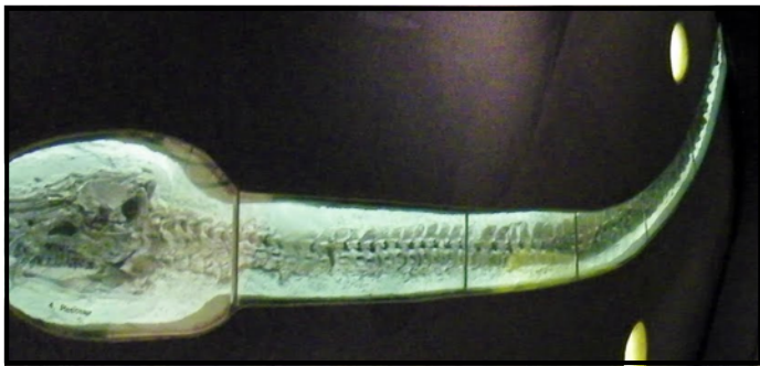
Plesiosaur at the Nebraska State Museum. LGMC members helped to excavate this specimen.