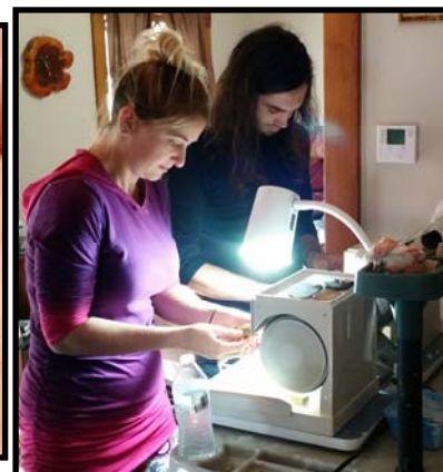
The "Nickies" making use of the inside Genie. Glad you were able to join us!