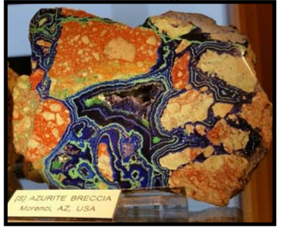
AZURITE BRECCIA Morenci, AZ, USA