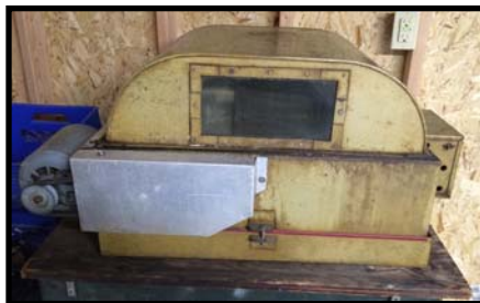
Lortone 12" cabinet rock saw Comes with 2 blades Asking price $700