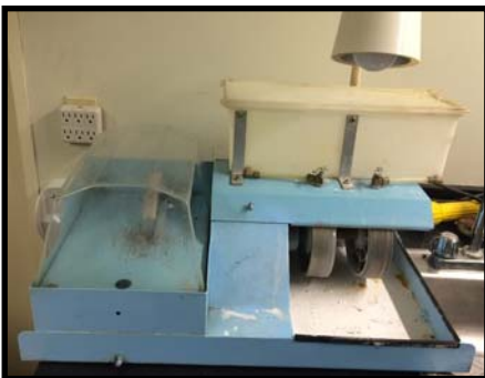
Lortone LU-6X combination trim saw and polishing unit. Fully functional and recently refurbished. Asking price $450

Contact Steve at 402.202.2253 or safischbein@gmail.com.