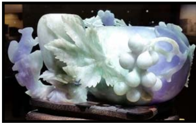
Wheaton College (above) Lizzadro Museum (below)