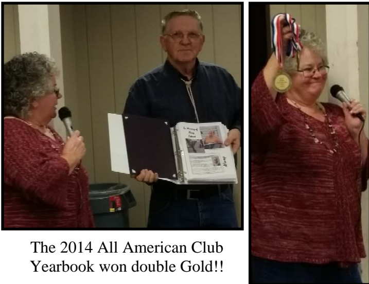
The 2014 All American Club Yearbook won double Gold!!