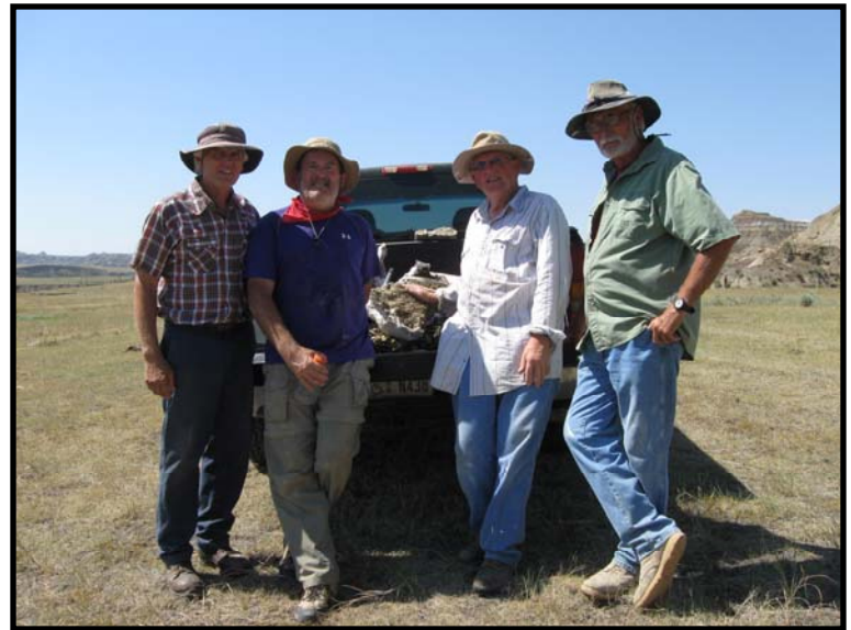
The Mighty Dino Hunters!