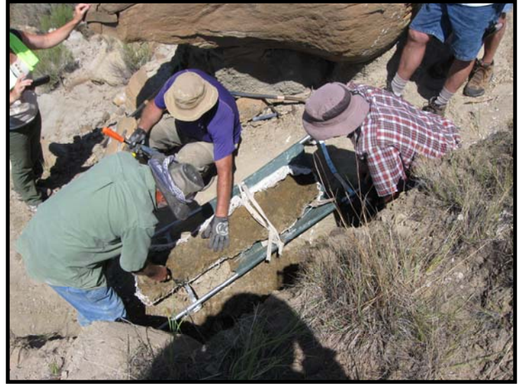
Rolling the bone onto a stretcher