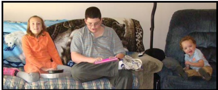
Even Mineral Monkeys have a good time at Rock Parties