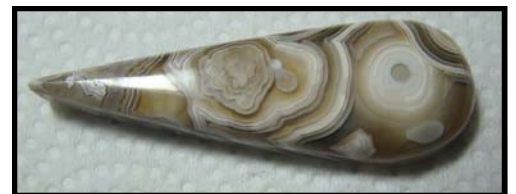
A sampling of what came out of the Rock Party. Unfortunately, not all of the photos turned out, so not everything is shown here.