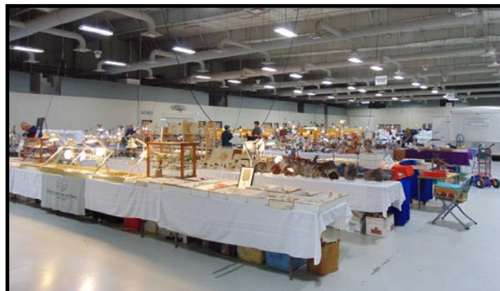
Sunday morning, as the show opened