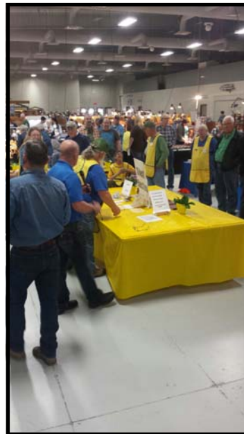
The live auction Sunday afternoon where some donated specimens and select library books were sold