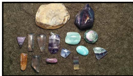
Corey's cabochons completed during the show