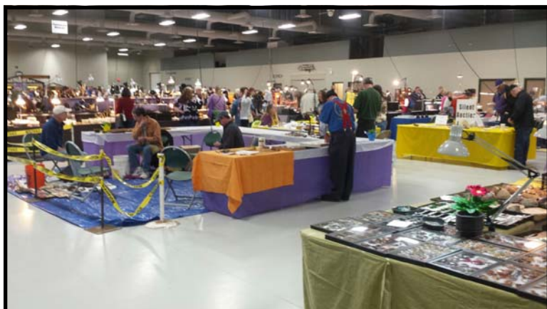
Saturday morning, just as it was starting to get busy