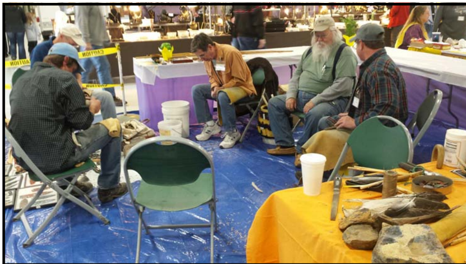
Flintknappers demonstrating their talents in the lithic area