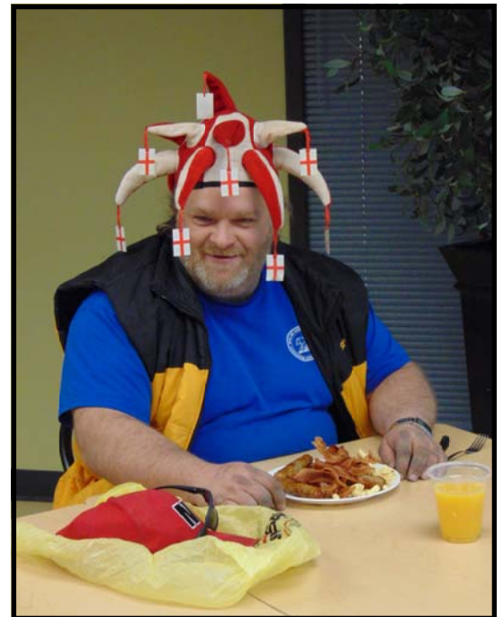
Yup. There is one in every crowd.