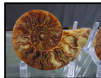
A couple of specimens for sale by vendors