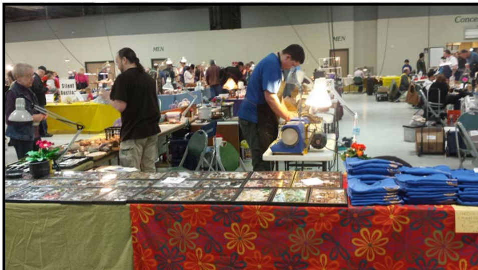
A view of the demonstration area