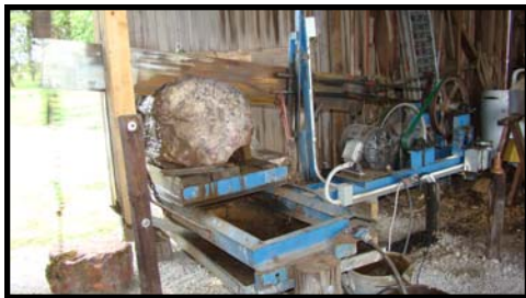
It takes this saw a long time to cut a slab