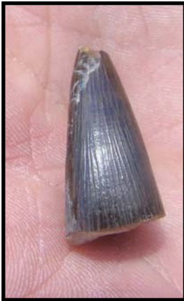
Mosasaur tooth, slightly over 1 inch long