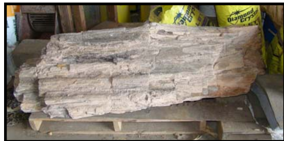
Now that's a log!