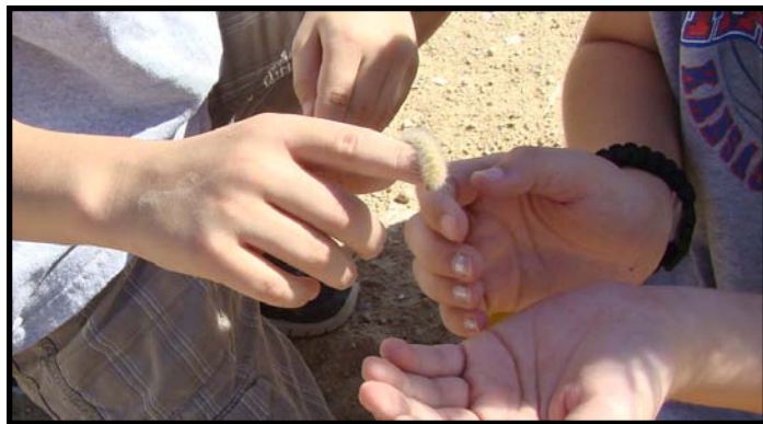
Ian and Jayden stop to examine a fuzzy caterpillar found while hunting for fossils west of Fairbury