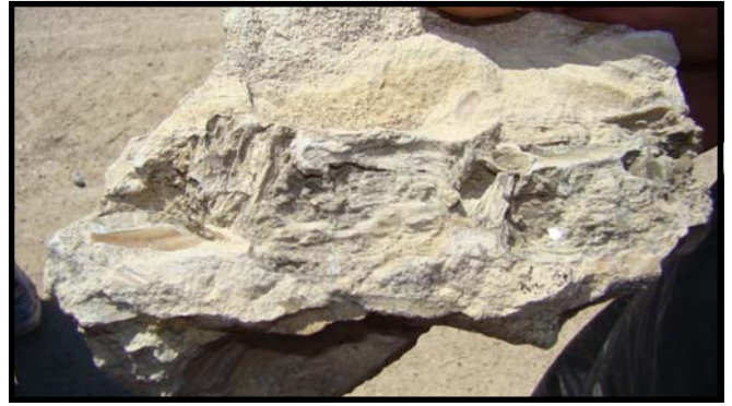
Petrified wood in limestone