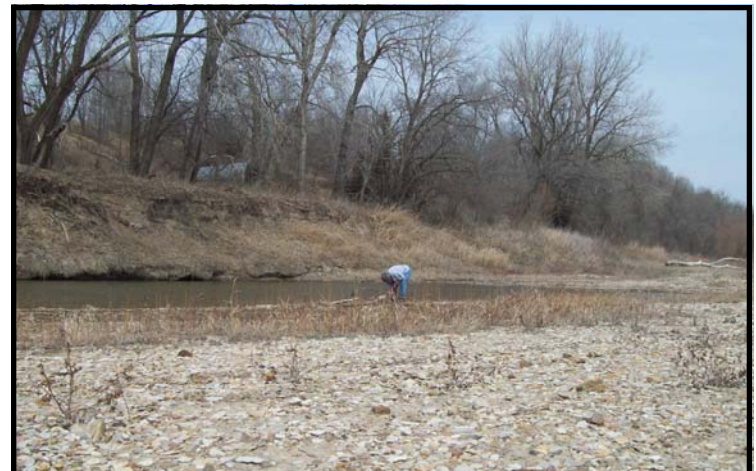
Collecting on the Nemaha