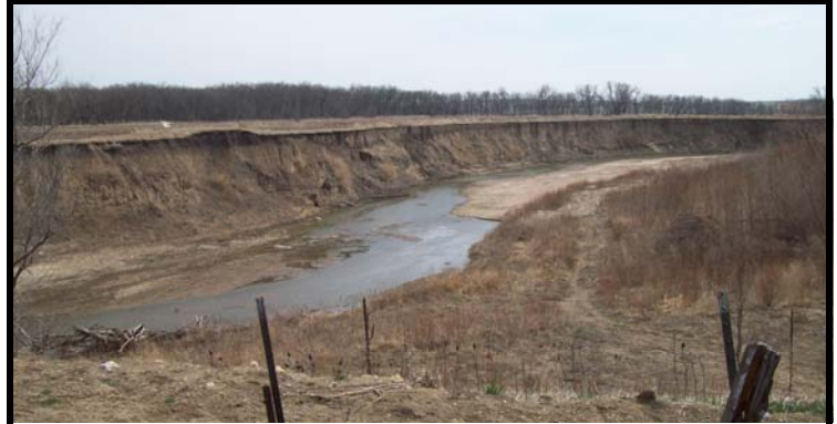
View of the Nemaha River

This editor did not receive an accounting of the Nemaha River field trip on Friday, April 5. However, some pictures were shared, so I shall pass them along.