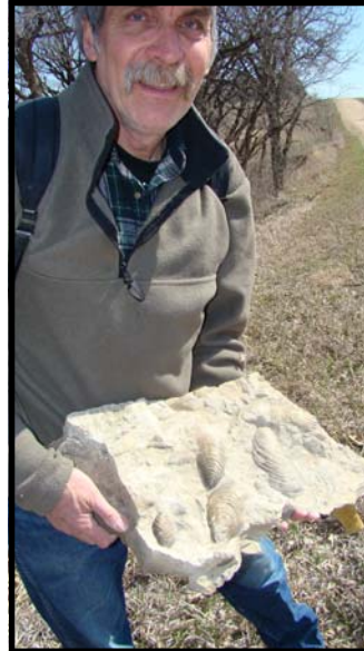
One happy hunter