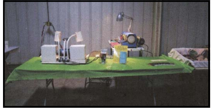
Lapidary Demonstration Booth

We all got dinner, T-shirts, cloth bags, and pens for volunteering!