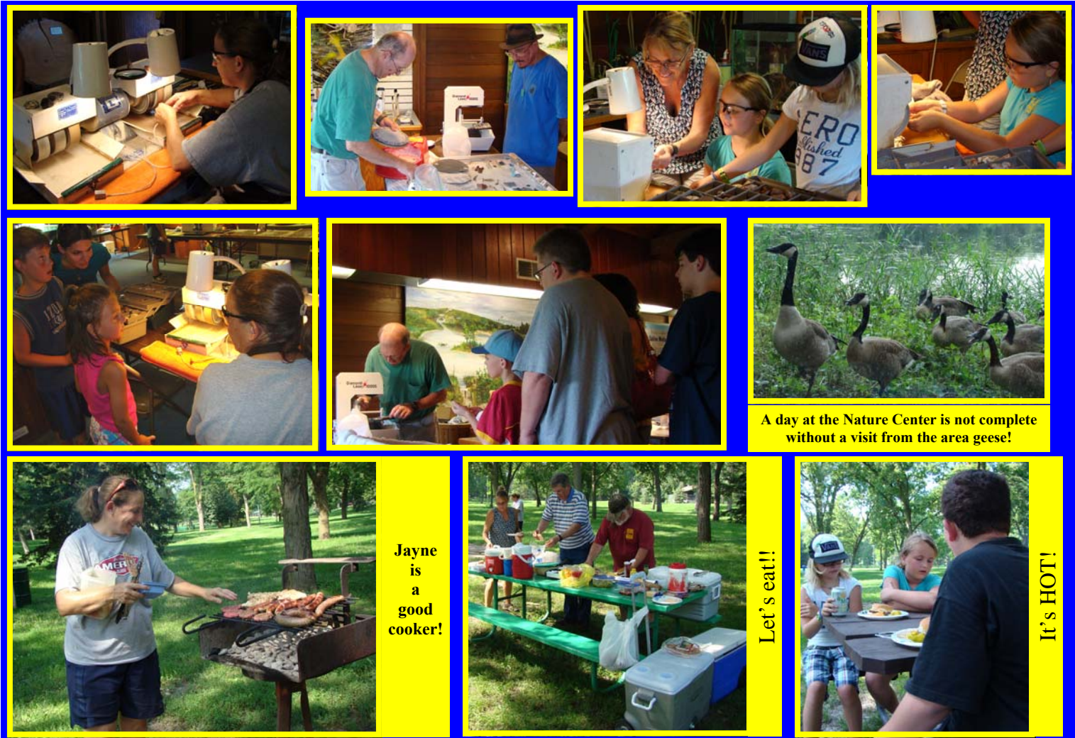
A day at the Nature Center is not complete without a visit from the area geese!