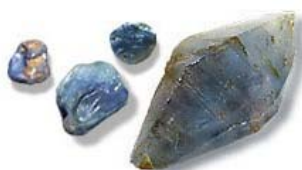
Rough Sapphire Crystals