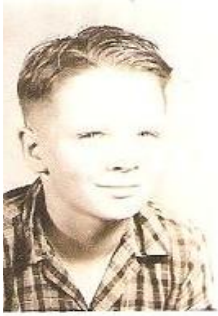
high school picture