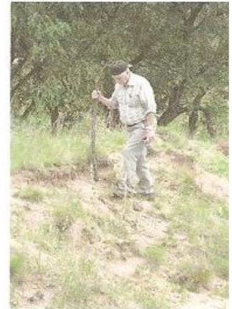
6-27-2009 rock picking