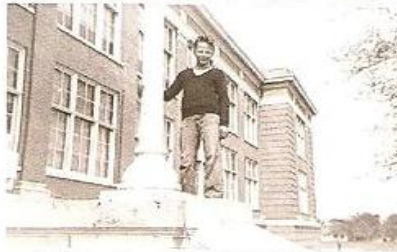
1949 in front of Whittier jr high