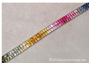
Rainbow colors of sapphires