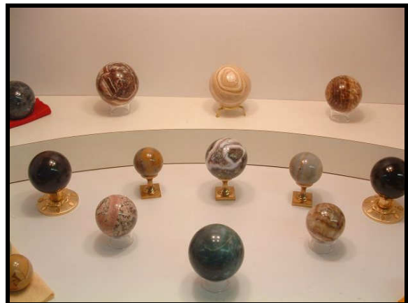
Display from 2006 Lincoln Gem & Mineral Club Show