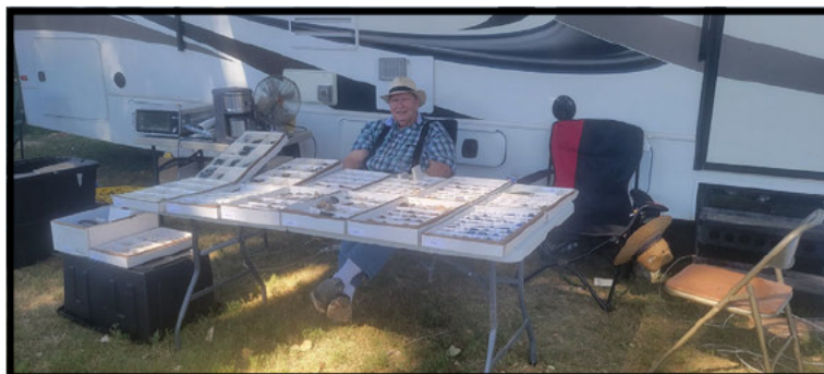
A few items for sale by JimsPastTime

The annual swap at Crawford is a lot of fun; buying, selling, and collecting. Consider attending next year.