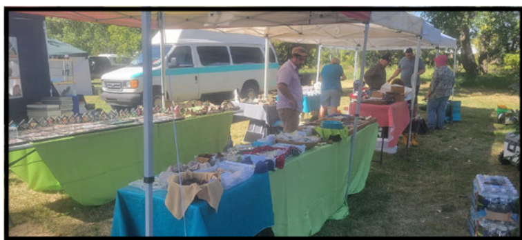
Hidden Gems by The Jewelry Connection