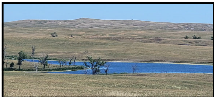
Agate Lake