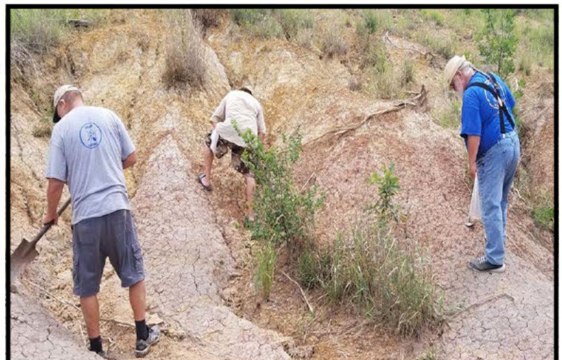
Road cut hunting for selenite crystals