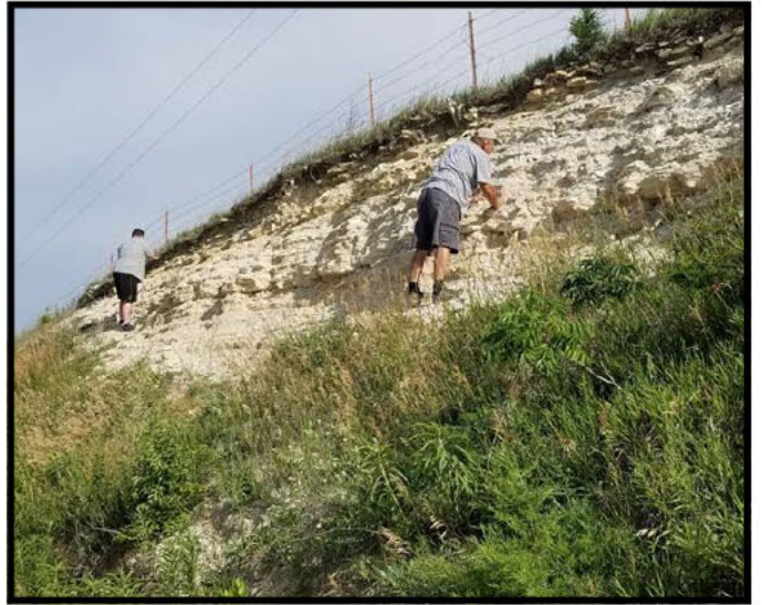
LGMC mountain goats hunting for fossils