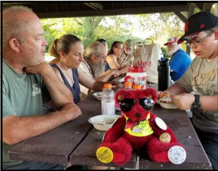
Friday's supper - E-bear got to go on the field trip, too!