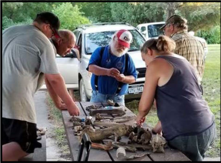
Friday finds from Big Sandy Creek