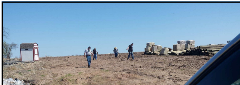
It was fun to hear, "Laker!!" sound across the fields—not just once, but multiple times.