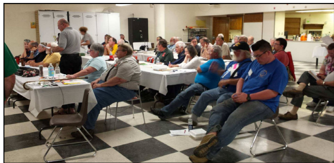
Midwest Federation Delegates Meeting.