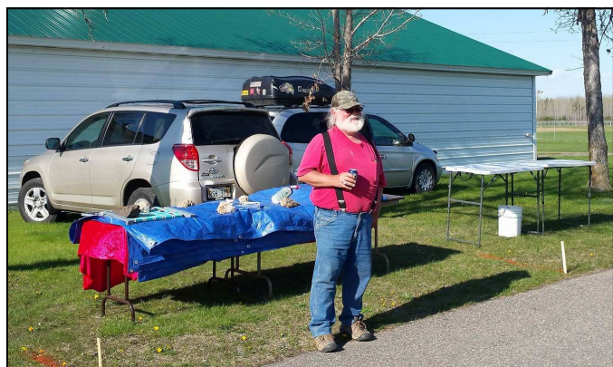
Wooly setting up for the tailgate part of the show.