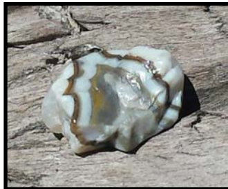
Is that a Fairburn? In Southeast Nebraska?