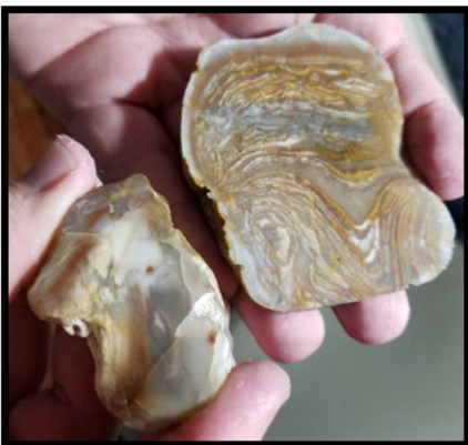
Stjepan's Prairie Agate