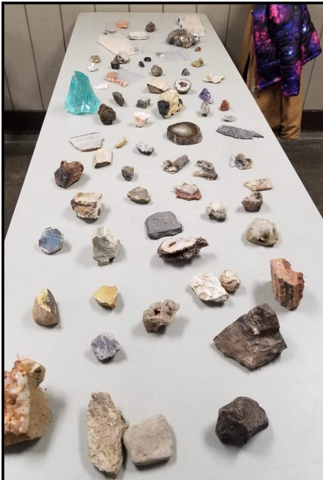
Bingo winners had a wide variety of prizes to choose from, courtesy of club members.