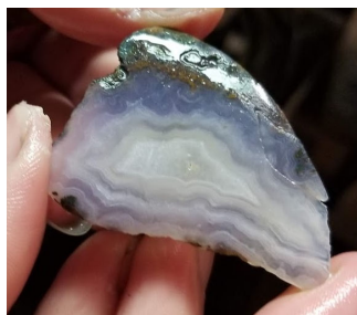
Evan's Aztec purple lace