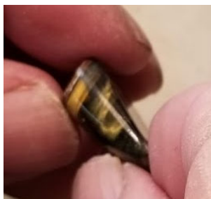
Eddie's little tiger eye