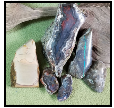
Some pretty stones completed during the rock party