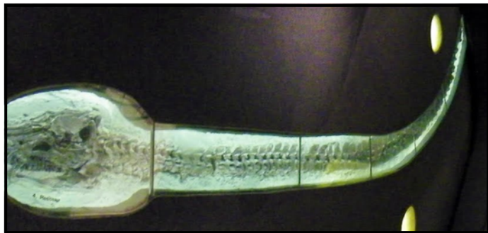
Plesiosaur at the Nebraska State Museum. LGMC members helped to excavate this specimen.