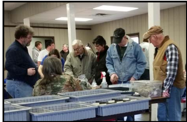
Oooooo! Look at that!