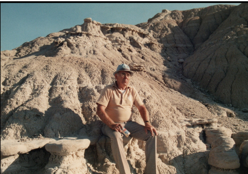
Lynn Wells Toadstool Park, Nebraska 1988