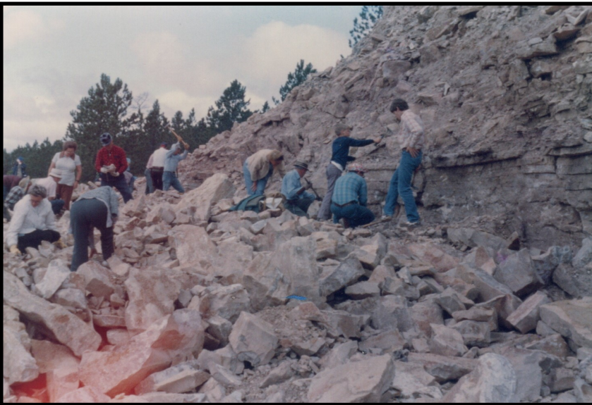
Custer, South Dakota