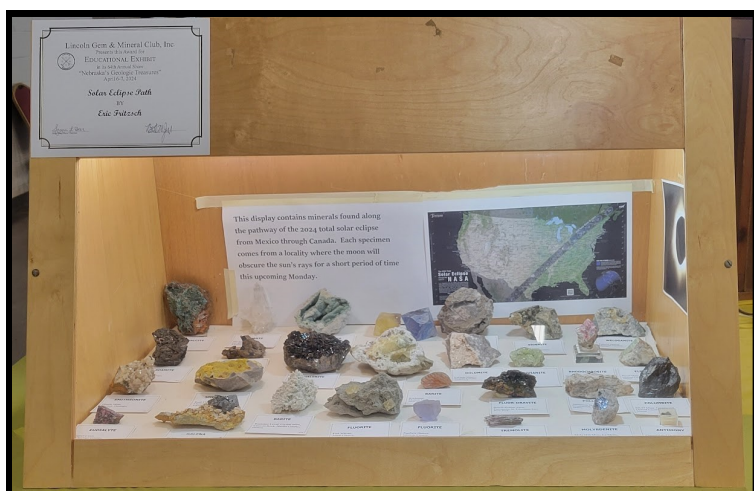
Eric Fritzsch's case of Solar Eclipse Path Minerals won First Place in Most Educational Display.