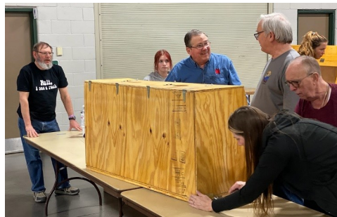
There were lots of helpers putting up (and tearing down) the display cases.