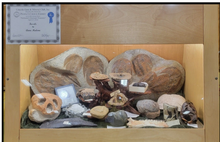
Anne Malone's case of Fossils won First Place in overall displays.

CONGRATULATIONS WINNERS!! THANKS TO EVERYONE WHO PROVIDED A DISPLAY AT THE SHOW.