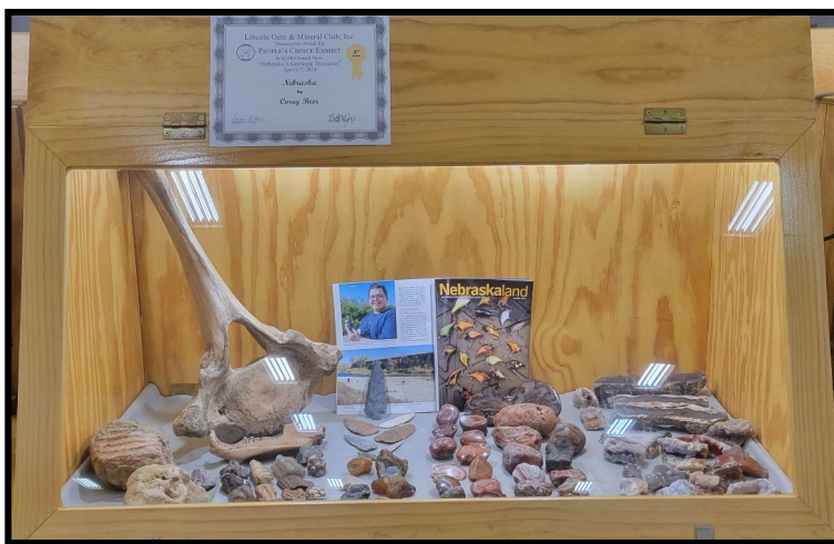
Corey Beer's case of Nebraska Specimens won Third Place in overall displays.