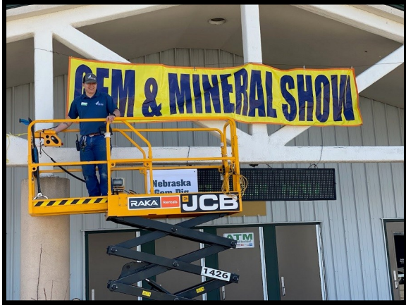
Event Center worker hanging our banner.