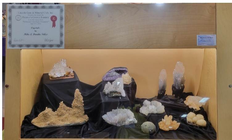
Mike and Donitte Stiles' case of Crystals won Second Place in overall displays.